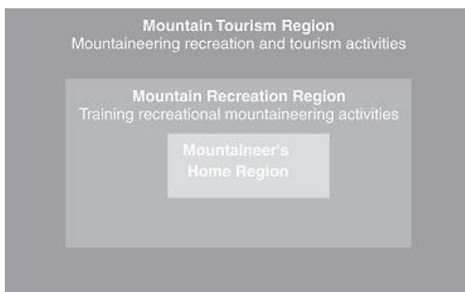
Figure 1: The relationship between the tourism and recreational region for mountaineering

Figure 1 (TM 2006) usefully illustrates the relationship between tourism and recreation relative to mountaineering. It demonstrates that recreational mountaineering can and often does precede mountaineering tourism. For instance, mountaineers residing in north Wales can partake in day-long mountaineering trips from their home region to the Welsh mountains during the entire year while also participating in holidays several times a year to the Scottish mountains, the Alps or mountainous regions located further afield. Recreational mountaineering trips can develop participants' skills and experience for future mountaineering holidays, and hence they can serve a training purpose. Although this example specifically relates to mountaineering, it also applies to many other adventure activities such as rock climbing, paragliding and canoeing.